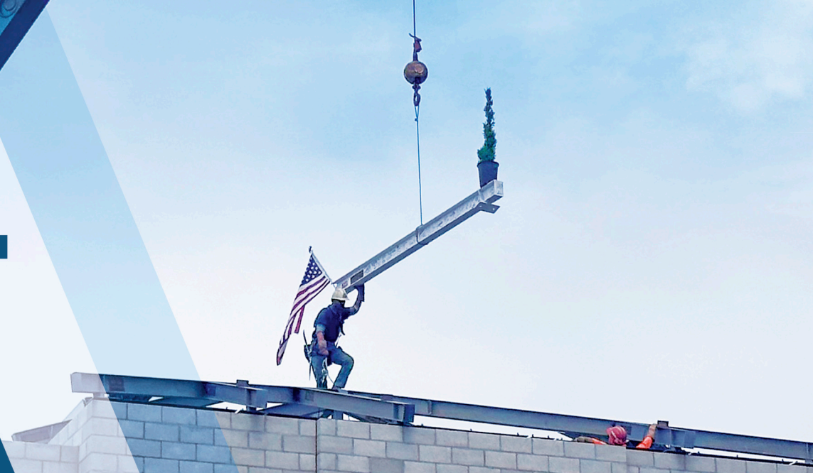
Topping Out Ceremony for New M&O Building – Fullerton College