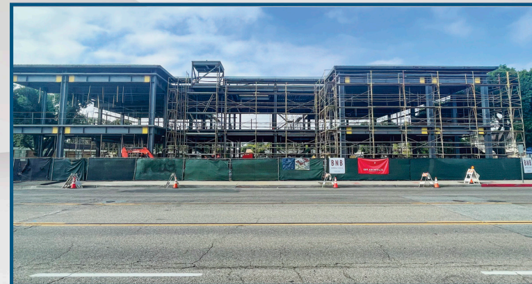
Completed steel structure for the Chapman/Newell Instructional Building - Fullerton College