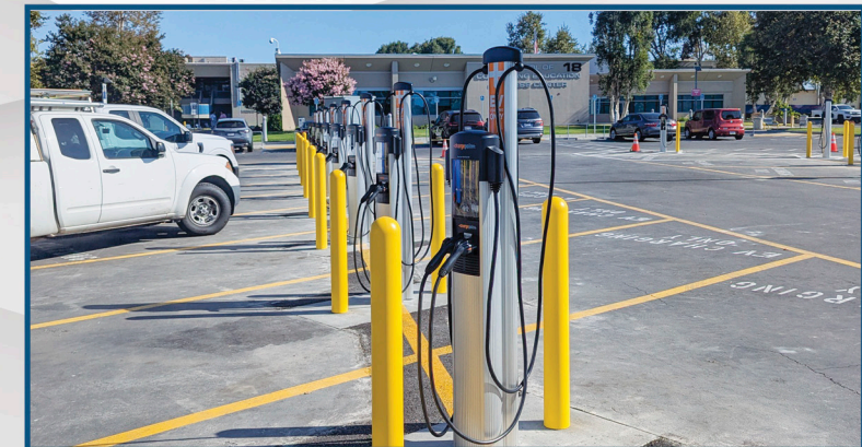
Completed installation of Electric Vehicle Charging Stations at Lot 4 - Cypress College