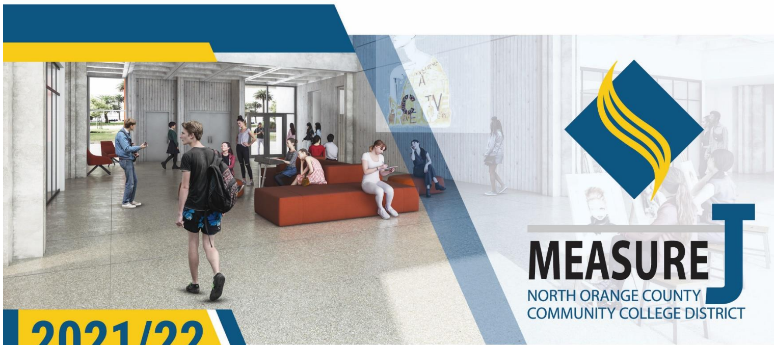
Design Rendering of the Fine Arts Building Renovation at Cypress College