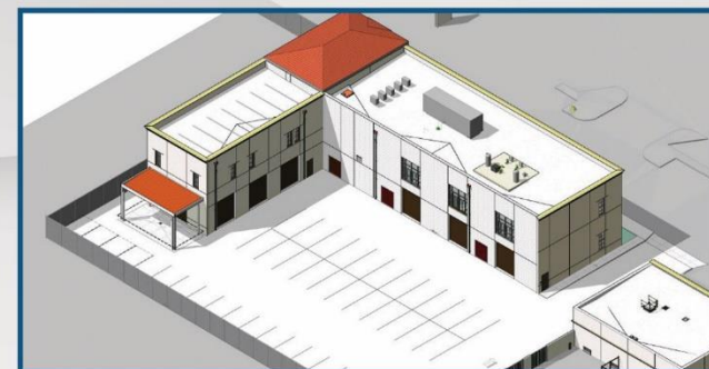
Design Rendering of the New Maintenance and Operations Building at Fullerton College