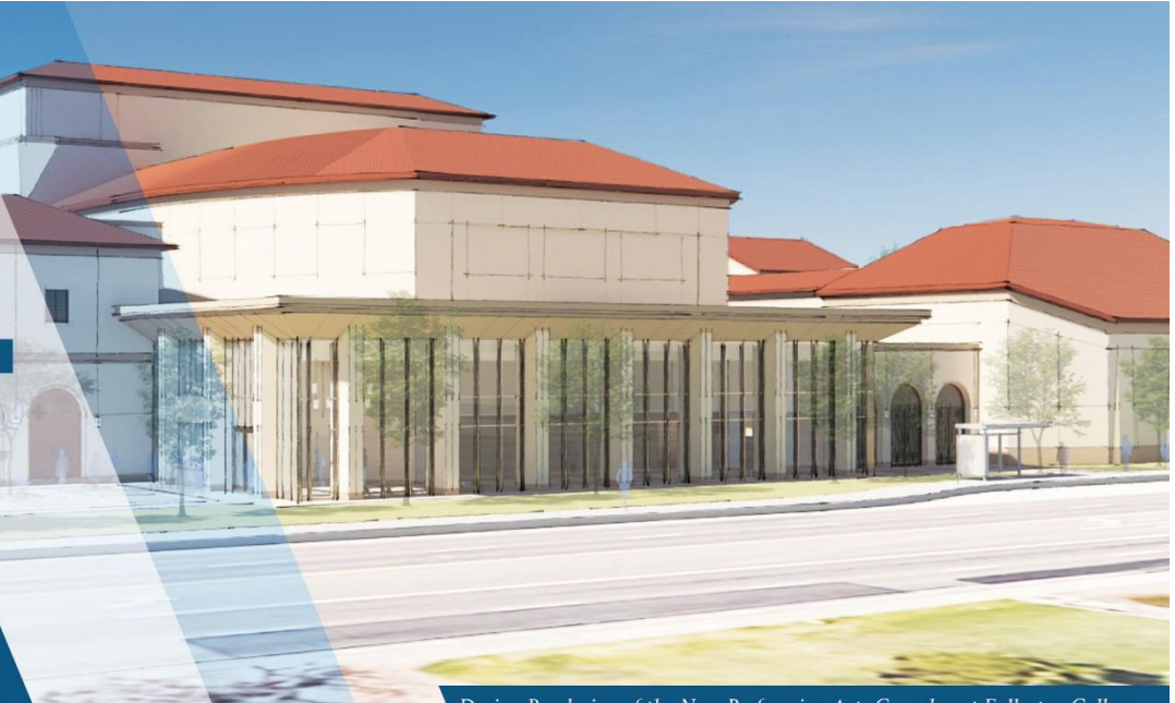
Design Rendering of the New Performing Arts Complex at Fullerton College