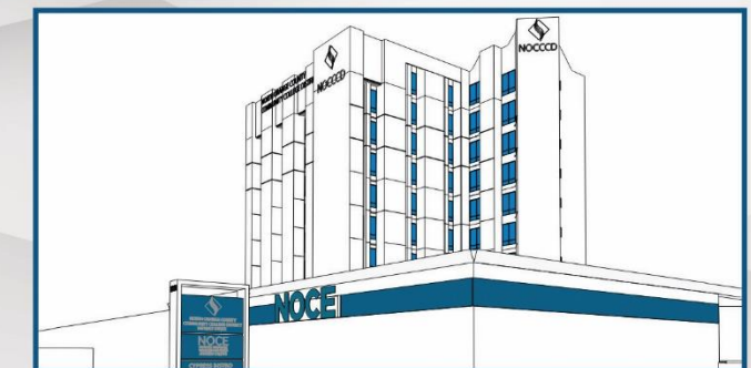
Sketch of the Exterior Signage at the Anaheim-NOCE Campus