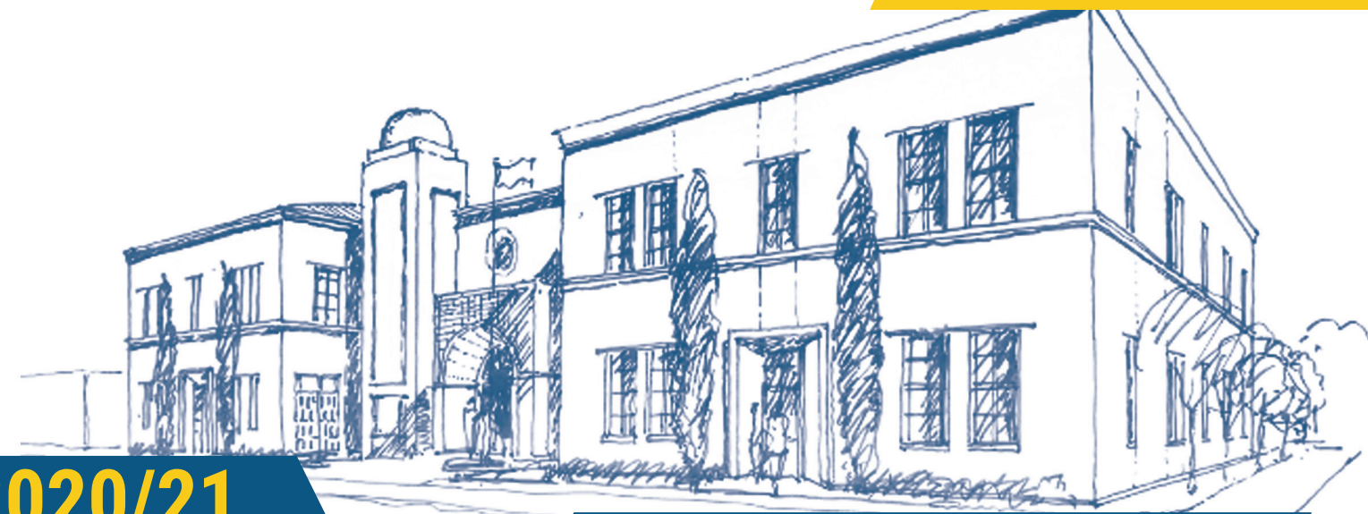
Design Rendering of the New Chapman/Newell Instructional Building at Fullerton College.