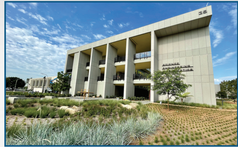
Completed New Science, Engineering, and Mathematics Building at Cypress College.