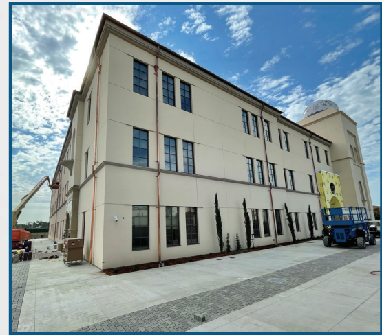
Construction Progress at the New Instructional Building at Fullerton College.

At Cypress College, the Fine Arts Building Renovation and Swing Space was submitted to the Division of the State Architect (DSA) for review and approval for construction. Design continues for the New Performing Arts Complex, Chapman/Newell Instructional Building, and the Maintenance and Operations Building at Fullerton College. The water intrusion life and safety renovation and associated swing space design are underway with an anticipated construction start in the second half of 2022 at Anaheim.