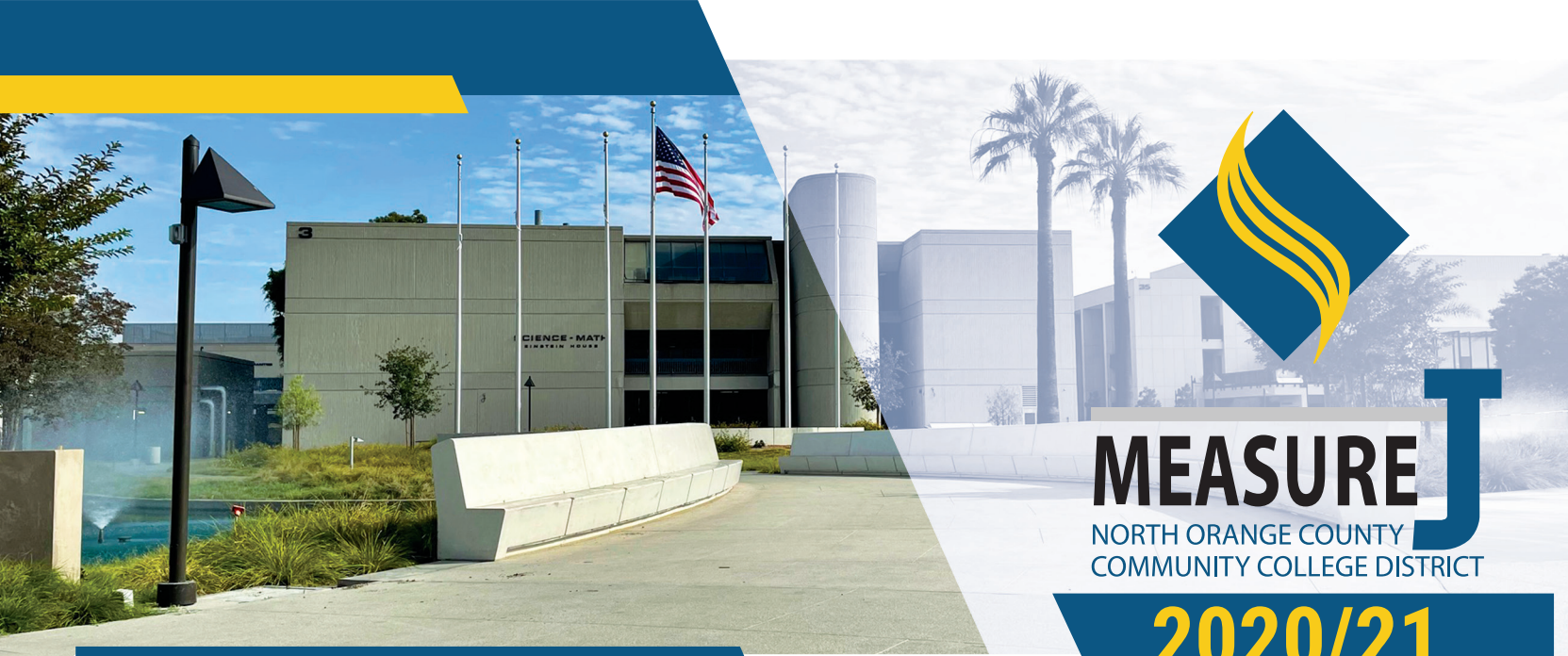
Completed Veterans' Memorial Bridge and Tribute Garden at Cypress College.