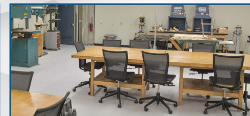
Completed Classroom at Swing Space - Fine Arts (Old SEM) at Cypress College