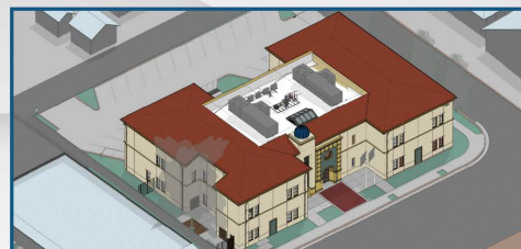
Exterior Rendering of the Chapman/Newell Instructional Building at Fullerton College