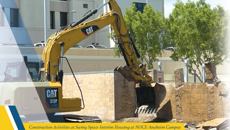
Construction Activities at Swing Space Interim Housing at NOCE Anaheim Campus